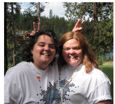
Summer Camp Volunteers

able to send youth that need financial assistance. While it is important that we operate in a sound fiscal manner, it is equally important that people come to camp for a positive experience that will last a lifetime. Would you consider joining the Ross Point team and providing a scholarship for a youth that might not hear the gospel any other way? The cost for Middler Camp is $165.00. The cost for all other camps is $239.00.